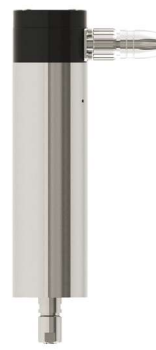
▲ Type AC angular connection